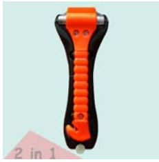
Item no.: SSF-08